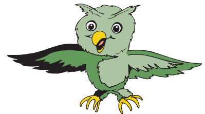
10 inches wide