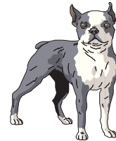
15 inches tall