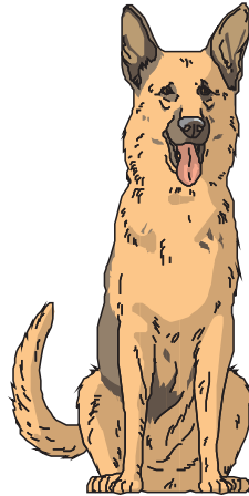
36 inches tall