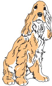
24 inches tall

Draw a square around the greater number. Circle the symbol.