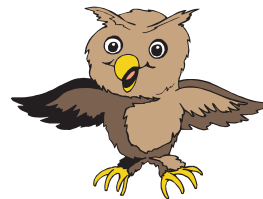
6 inches wide