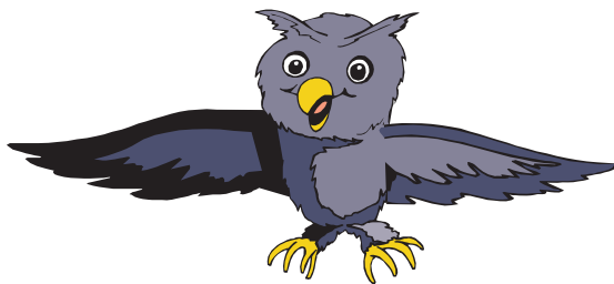
15 inches wide